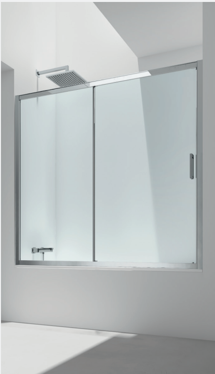
A6_11000 Soprasvasca / Bath shower screen