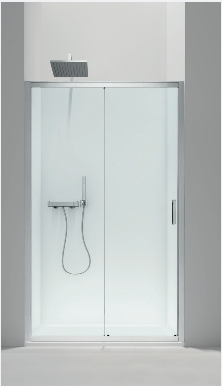
A6_1000 Box doccia / Shower cubicle