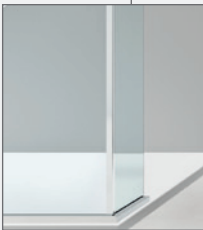
optional + 1 fisso optional + 1 fixed