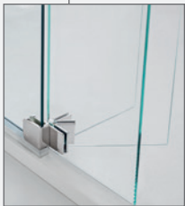
optional aletta girevole swivel deflector optional